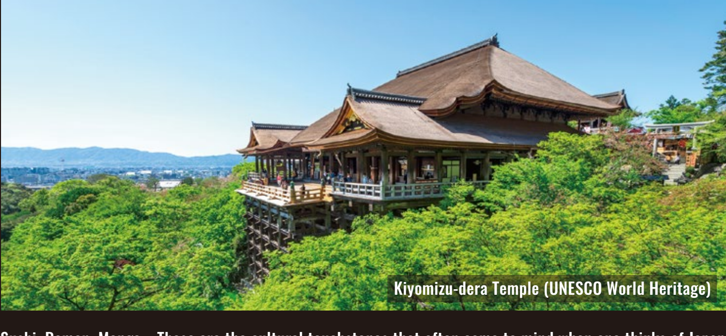
Kiyomizu-dera Temple (UNESCO World Heritage)

Sushi, Ramen, Manga... These are the cultural touchstones that often come to mind when one thinks of Japan. However, Japan's rich cultural heritage extends far beyond these contemporary icons, spanning more than 2,500 years. At its core lies a concept we can aptly describe as 'sustainability,' an unwavering commitment to pursuing mutual and enduring prosperity in harmony with both fellow humans and the natural world, rather than chasing individual short-term gains. Remarkably, this commitment predates the global sustainability trend, with over 30,000 Japanese enterprises having thrived for more than a century without formal recognition of 'sustainability.'